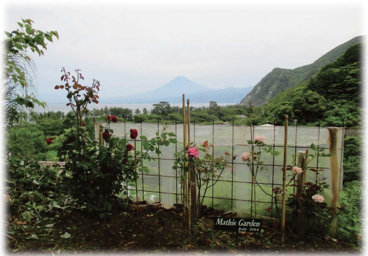
Mt. Fuji, a world cultural heritage site, viewed from the Farm Garden in Izu, Peninsula